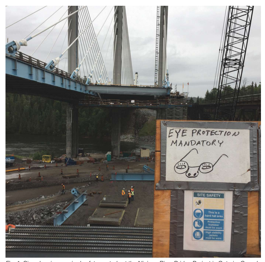
Fig. 1: Sign showing required safety controls at the Nipigon River Bridge Project in Ontario, Canada

s safety professionals, we are tasked with ensuring our company activities conform to regulations. It's up to us to help supervisors achieve all the requirements for job site safety. This usually means implementing solutions according to the hierarchy of controls . As the name suggests, there is a preferred order to deploying safety solutions, with engineering controls coming first, followed by administrative controls, and then by personal protective equipment (PPE)—the last line of defense.