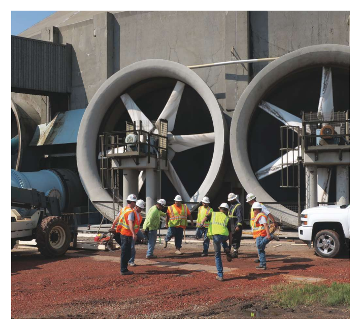
Fig. 3: Workers catch up and share stories during stretch and flex sessions at the Antelope Valley Station in North Dakota

results of our commitment but doesn't measure engagement. And that's what we should concentrate on to make our next leap forward in safety.