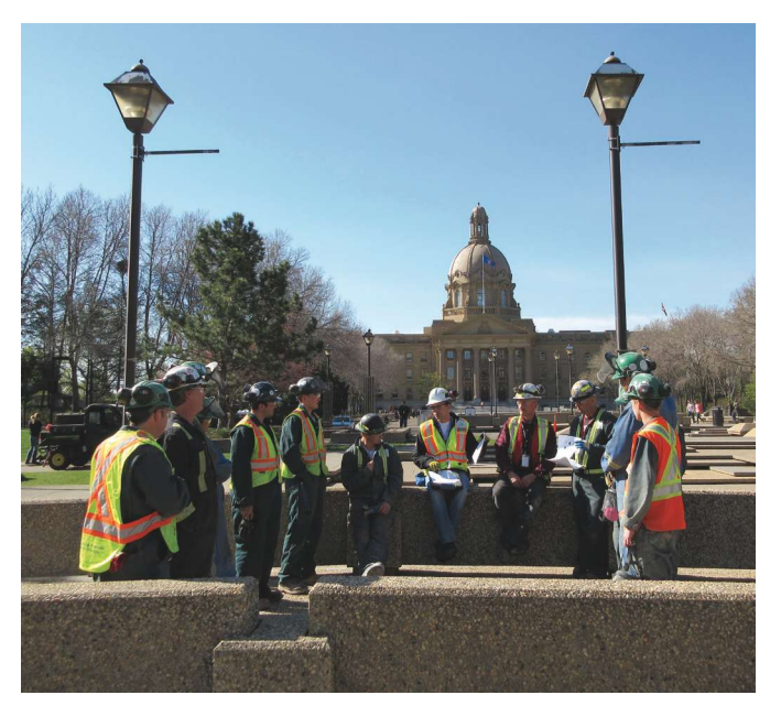
Fig. 4: Toolbox session helps share safety messages and continuous learning of behavior-based safety programs in front of the Legislative Building in Edmonton, AB

Sharing stories makes future incidents less likely to happen, creates a sense of community, and encourages people to look out for each other. When leaders start to share their own stories of how they nearly got hurt at work or at home, they actively participate in the building of a stronger safety culture, showing