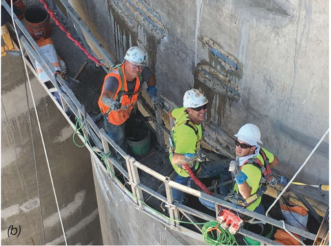
Fig. 5a & b: Workers are encouraged to work together and watch out for one another, building strong culture and teamwork even on the most dangerous projects